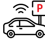
Free parking at the workplace