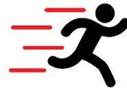
SUHNER-Fit + The Gym