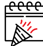
Excursions and events