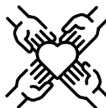
Diverse and open working environment