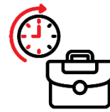
Part-time arrangements possible