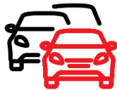
Use of company pool vehicles incl. fleet discounts