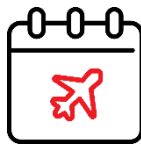
Attractive vacation policy