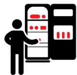
Fel-Fel vending machine