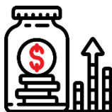
Excellent occupational pension plan