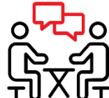
External social counseling