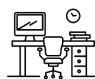
Ergonomic and spacious workstations