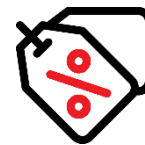
Brands for Employees