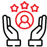
Generous loyalty bonuses